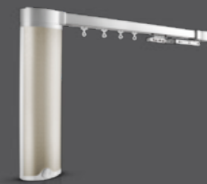
Glydea ULTRA 60e